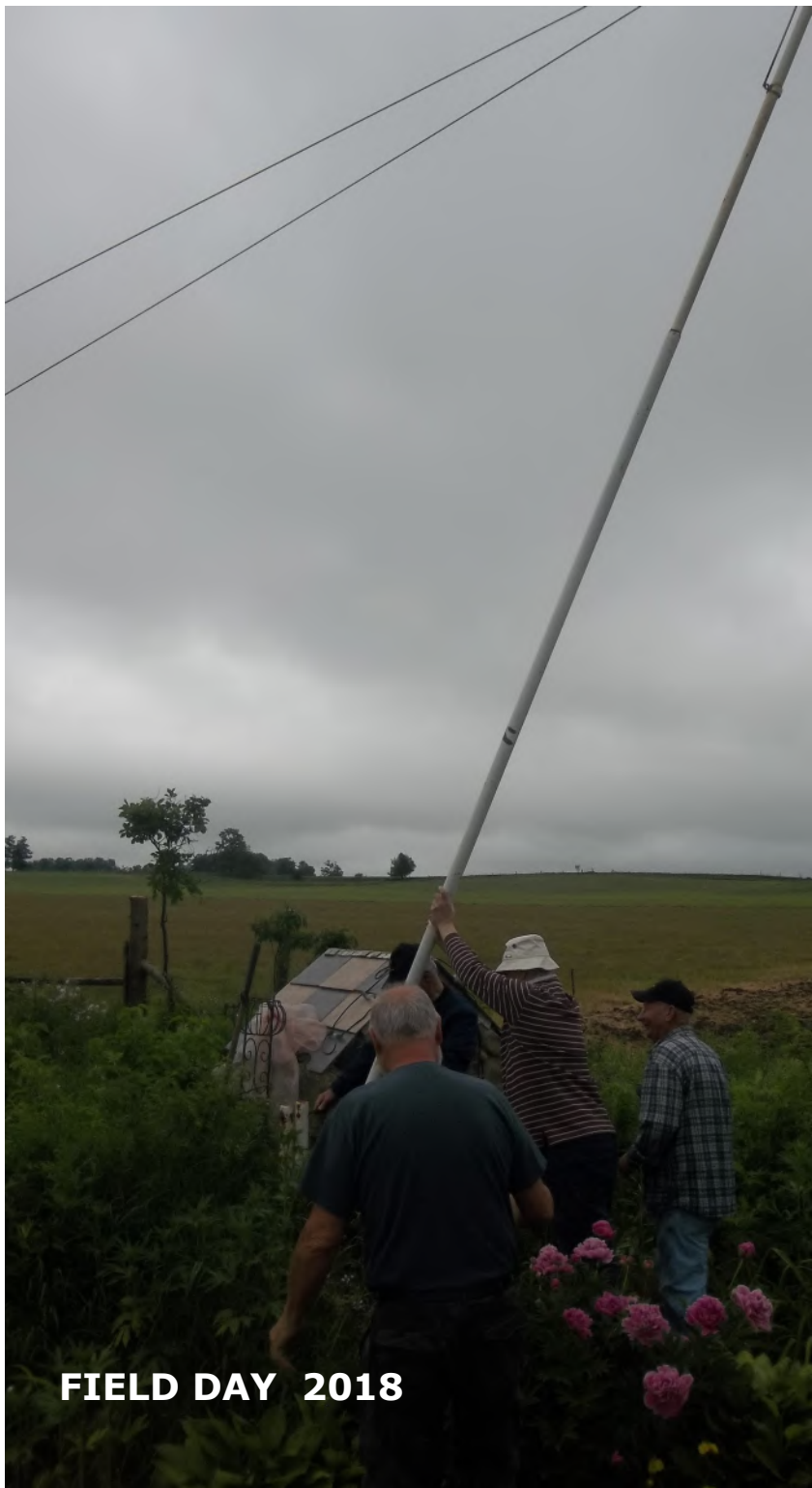
FIELD DAY 2018

In an emergency, tune Into our repeaters, UHF 444.700 or VHF 147.390 or HF 3.755 LSB or Simplex 147.510 For coordination and assignments.